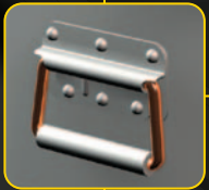
Spring loaded handles