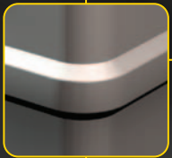
Aluminium construction with integral formed ribs for extra strength